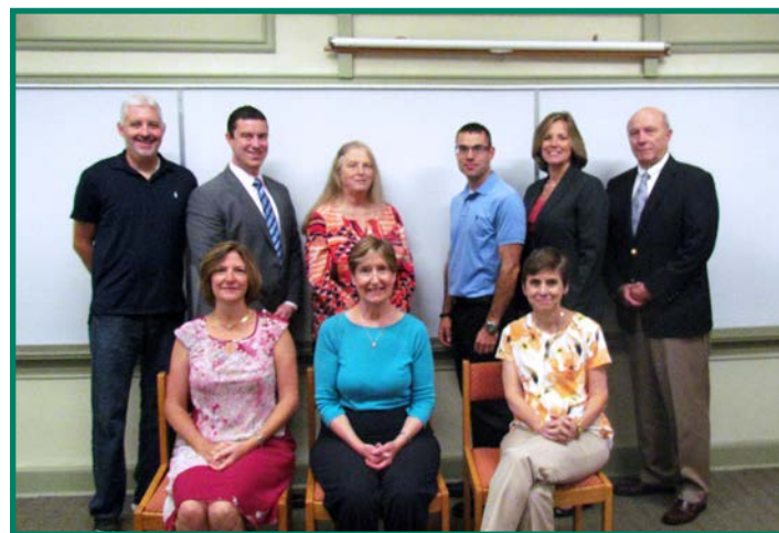
Board of Directors 2016 – 2017

If I had to sum up a common thread that ran through so many of our activities here at the ALC in 2017, it would be outreach – outreach into the larger community beyond the walls of our facility, and into locations where people live, work and learn. We are acutely aware, perhaps more than ever before, that we must engage and collaborate with our community partners in order to address the ever-changing needs and pressing issues that many of our neighbors face, day in and day out.